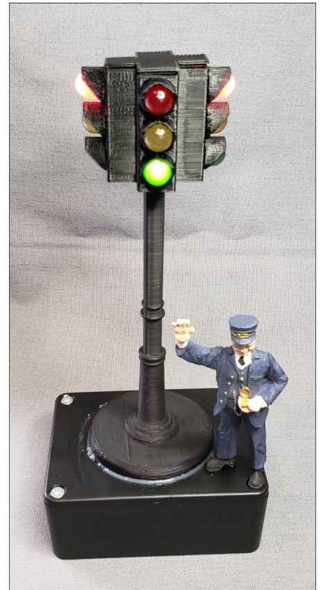
Combined to make a working traffic light !